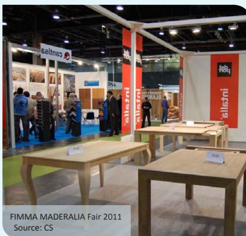
FIMMA MADERALIA Fair 2011

There is the perception that one spends a lot of time at home, and therefore, clients have new demands regarding the use of available space.