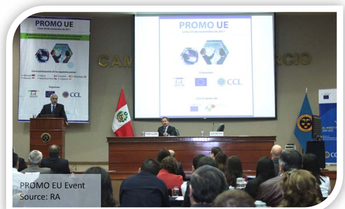
PROMO EU Event