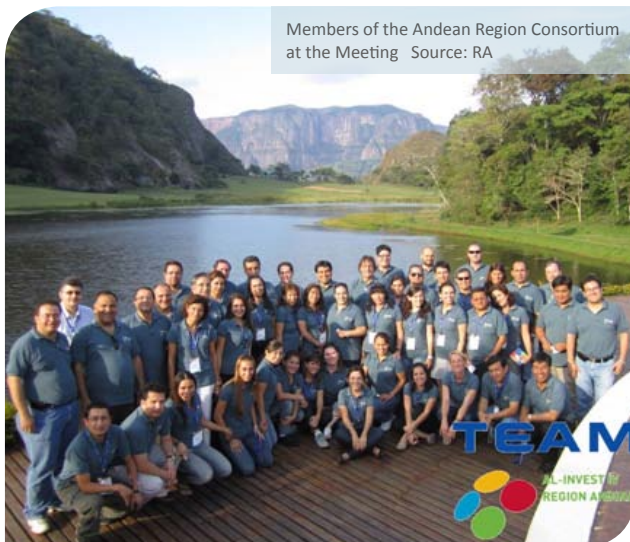
Members of the Andean Region Consortium at the Meeting

October 26-28, Santa Cruz de la Sierra, Bolivia