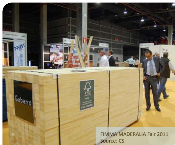
FIMMA MADERALIA Fair 2011

Contact: Diana de Ávila Tordecilla ddeavila@cccartagena.org.co