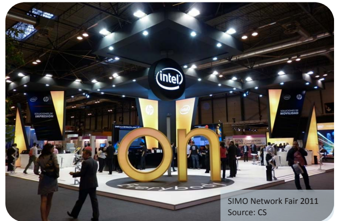
SIMO Network Fair 2011