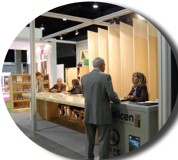
FIMMA MADERALIA Fair 2011

The spirit of the MCV Consortium is as strong as wood in its will to strengthen and promote the sector. Market studies, workgroups and training are some techniques used to achieve that.