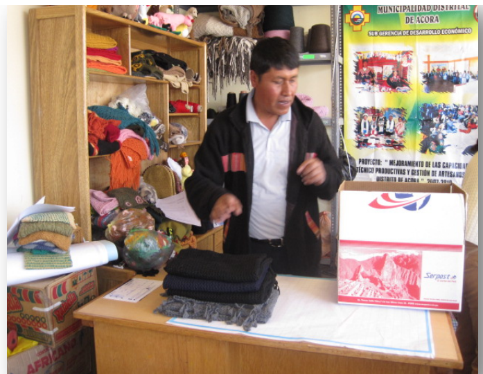
Tailoring Cluster in Alpaca de Ácora, Puno