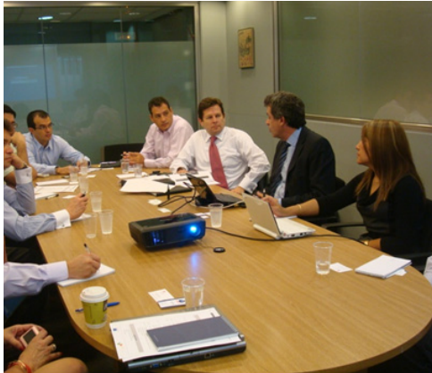
The Transfer of Know-How to Partners of the Andean Region Visiting the Spanish Chambers Of Commerce

The Andean partners landed in Spain this April to learn how the departments of the Chambers of Commerce of Bilbao, Barcelona and Almería work and exchange experiences and knowledge. The visit included know-how transfer activities so that participants from the Andean Region could learn how to create new services to support companies and enhance their institutions.